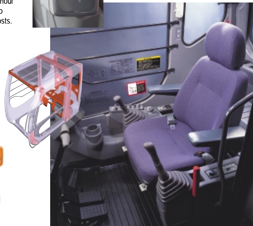
Cab design both guards the operator and contributes to efficient operation through its comfortable, ergonomic layout and its CRES design.